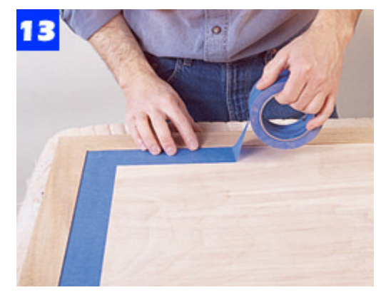
With the edging in place, mask the plywood panel to keep the finish from getting on the surface.

Screw the tabletop fasteners to the apron. Turn the desktop over and attach the base with an even overhang on all edges.