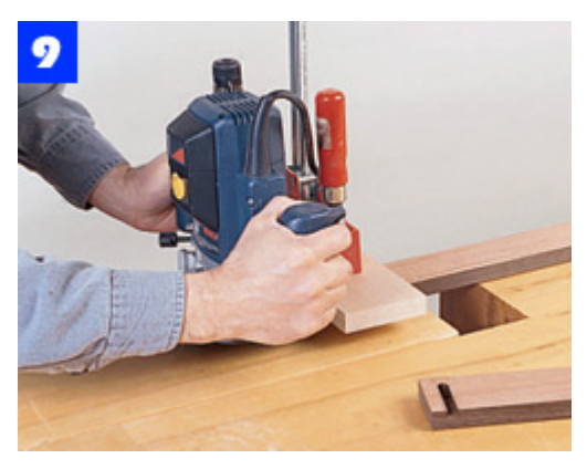
Rout the dovetail slots in the drawer fronts and sides. A straight board clamped in place guides the cuts.

the long aprons to the side subassemblies. Make sure that all legs rest evenly on the floor.