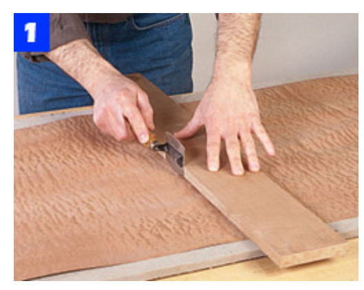
Use a veneer saw and straight board to cut the veneer. Make light passes to avoid tearing the wood.

Use a plunge router with a spiral up-cutting bit to cut the leg mortises (Photo 3), and finish each by squaring the ends with a sharp chisel.