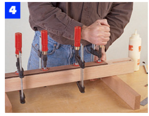
Mark the panel positions on each leg, spread glue on the back of a panel, and clamp until the glue sets.

Cut 1-in.-thick mahogany to size for the aprons. To make the openings in the drawer apron, rip three consecutive strips from a wide piece of mahogany stock--the first 1 in. wide, the next 2-1/2 in. wide, the last 1 in. wide (Photo 5). Crosscut the middle strip to create the drawer openings, and use joining plates and glue to reassemble the parts.