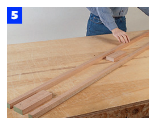
Rip three consecutive strips for the drawer apron. Cut the wider middle strip for the center and end sections.