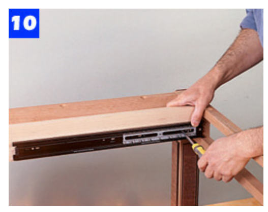
Attach the drawer slides to the stretchers. Use only two screws in the horizontal slots so you can make adjustments.

Cut parts for the drawer pulls from wenge stock. To make the small mounting blocks, use a dado blade and a zero-clearance table saw insert to cut a groove in the edge of a 12-in.-long strip. Use feather boards and pushsticks to keep your hands away from the blade. Then, crosscut the small blocks and glue the pull parts together (Photo 11).