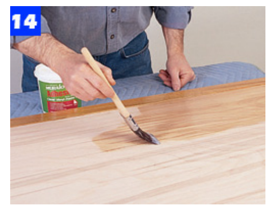
After finishing the edging, spread vinyl wallpaper paste on the panel. Allow it to dry, then apply a second coat.