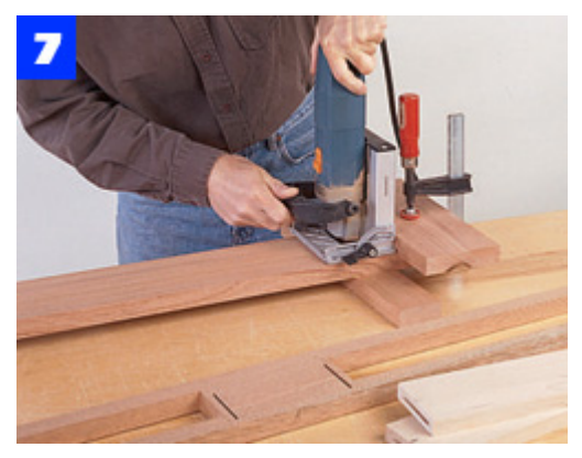
Use the plate joiner to cut the slots for the joints between the drawer stretchers and the front and back aprons.