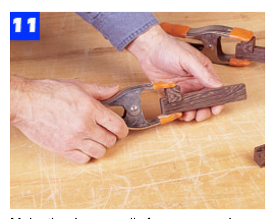
Make the drawer pulls from wenge pieces. Use spring clamps to hold the parts together while the glue sets.

We used Waterlox Original Sealer/Finish to finish our desk. Use a brush or rag to spread the finish and let it soak in for about 30 minutes. Wipe off all excess, leaving only a damp surface, and let it dry overnight. Lightly scuff the finish with 320-grit