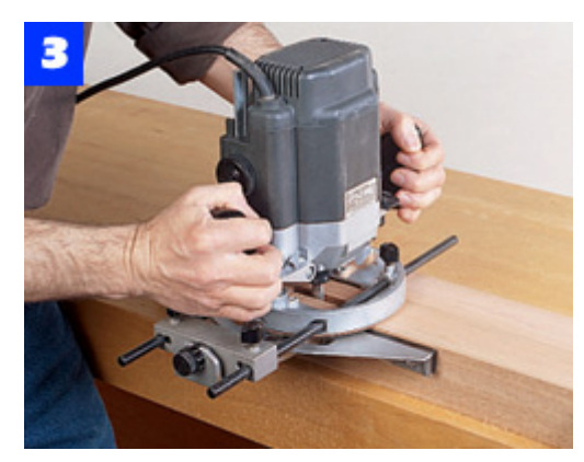
Rout the mortises in the legs. Clamp a second leg to the workpiece to support the router base at each leg end.