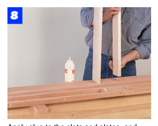
Apply glue to the slots and plates, and then assemble the parts. Clamp and check that the frame is square.