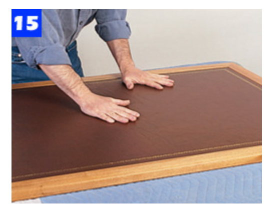
Roll the leather onto the panel while fitting it tightly against the edging. Use your hands to push out any bubbles.