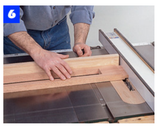
Use a dado blade to cut the tenons on the apron ends. The rip fence acts as a stop to ensure uniform tenon length.

Install a dado blade in your table saw and cut the tenon cheeks on the apron ends (Photo 6). Adjust the blade height and hold the aprons on edge to cut the shoulders at the top and bottom of each tenon, and check the fit of each joint. Use a Forstner bit in your drill press to bore the recesses in the top edge of each apron for the tabletop fasteners. Then, glue the veneered panels to the aprons, and sand the parts to 220 grit.