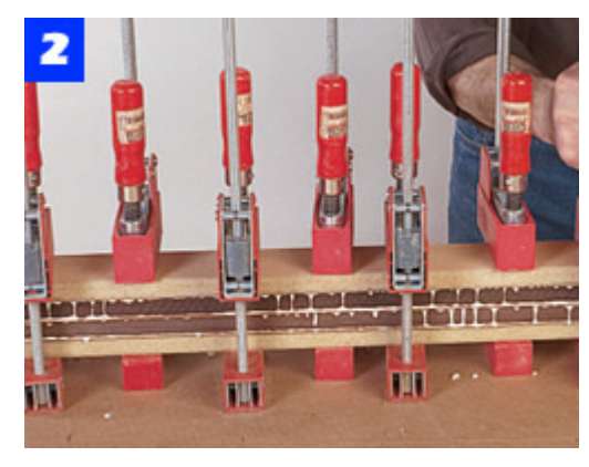
Stack the pieces with paper between each panel and on the top and bottom. Add 3/4-in. cauls and apply clamps.