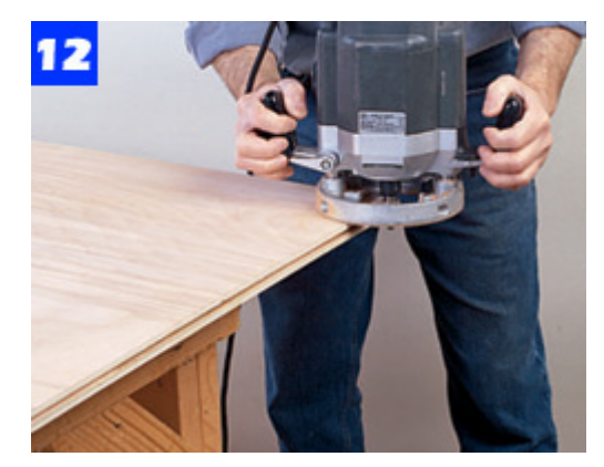
Use a slot cutter to rout the groove around the edge. Cut a matching groove in the mahogany edging.